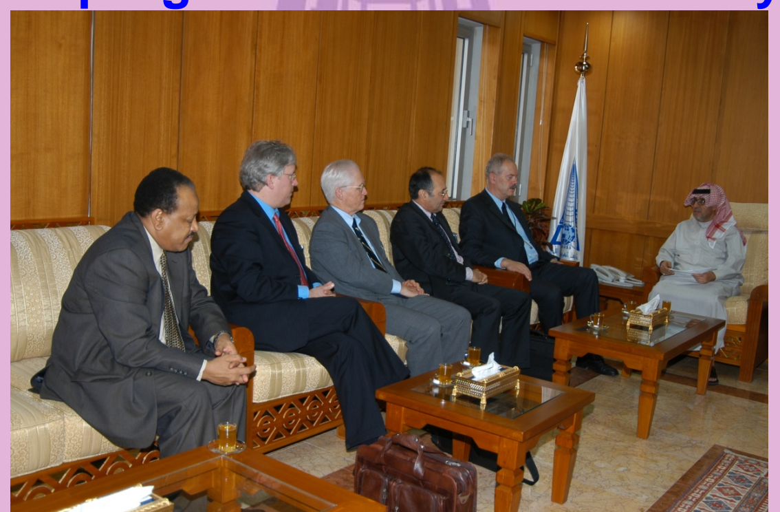
International Symposium on Nuclear Security, Vienna, 30 March – 3 April, 2009

The IAEA office of nuclear security approached NAUSS, as a leader in security sciences in the Arab world, to form a partnership aiming at combating nuclear terrorism through conducting training and education programs in nuclear security.